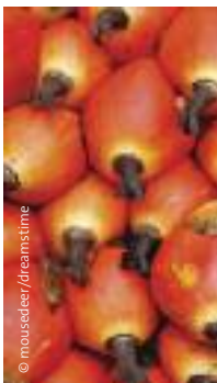
Below: Palm oil seeds. Right: Land being cleared for palm oil in Ketapang, Indonesia.

Sime Darby's expansion into Liberia is part of the company's ambition to reach 1 million hectares of plantation land in the next five years. 21 This would very nearly double its current palm oil plantations area and would inevitably involve large scale deforestation to create new land. Sime Darby is not alone. Other RSPO companies with some certified plantations, for example IOI and Cargill, are also expanding their operations into new land including forest.