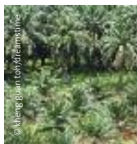
Palm oil plantation.

New demand for palm oil for biofuels is already leading companies, such as Sime Darby, to chop down forest to create new plantations.