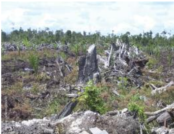
Peat land forest cleared for oil palm expansion in Ketapang, Indonesia.

As Sime Darby’s certified plantations start supplying palm oil for biofuel instead of for other products, new plantations need to be established to maintain the supply for the other products. The EU biofuels market and other new palm oil demands are driving Sime Darby’s expansion into tropical rainforest in Indonesia and Liberia.