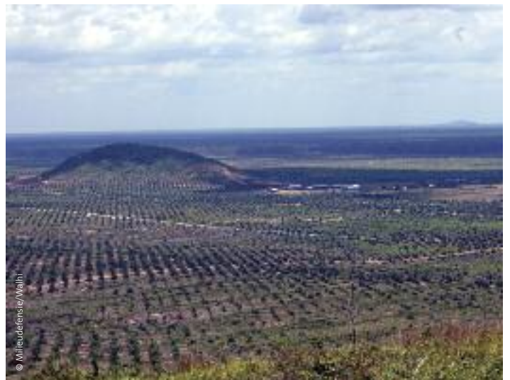
Palm oil plantation, Indonesia.