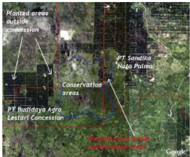
A satellite image shows palm planted in protected forest areas in Ketapang.

Sime Darby’s plantations in the Ketapang district in West Kalimantan, Indonesia, are unlikely to achieve RSPO certification in the near future. The company has illegally deforested Protected Forest (Hutan Lindung) in Ketapang and is producing palm oil on this land. Sime Darby’s 100-per-cent-owned subsidiary PT Budidaya Agro Lestari (PT BAL) has 2,600 ha of concessions that overlap with Protected Forest. In 2003 a Forestry Department team discovered that part of this has been cleared without permission. Another Sime Darby’s wholly-owned subsidiaries, PT Sandika Nata Palma (PT SNP) has a 1,300 ha concession that overlaps Protected Forest. Parts of this have been cleared and planted without permission.