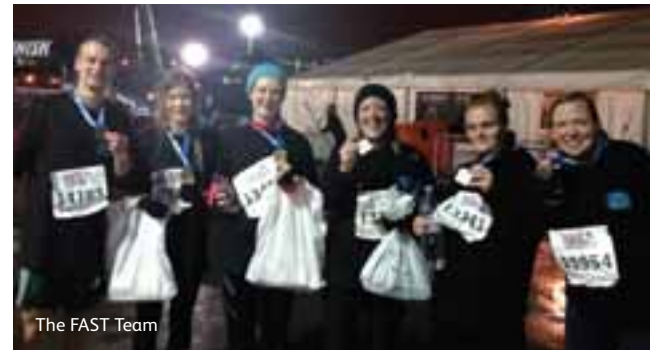
The FAST Team

Battersea Power Station supported FAST ( www.fast-london.org ) by securing tickets to the Men's Health Survival of the Fittest event. A team of young people, staff and supporters from FAST took part in completing the obstacle course involving lots of running, climbing and even crawling through ice! Through sponsorship FAST raised over £1000 to help fund the much needed outreach, sport, mentoring and employability work they do with young people on and around the Patmore estate.